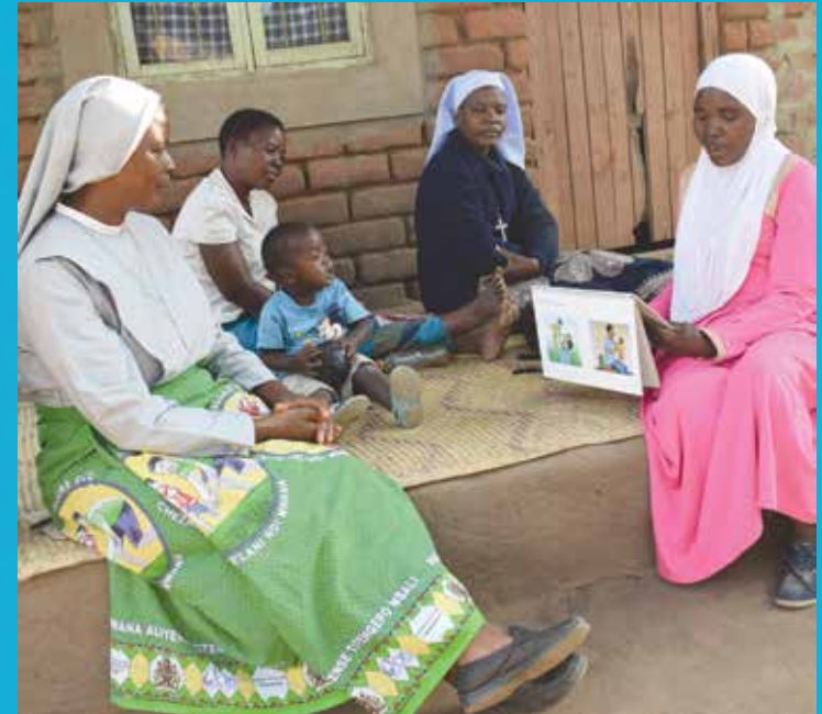
Neighbourhood women under the Sacrementines Sisters meet for ECD sessions in Ulongwe